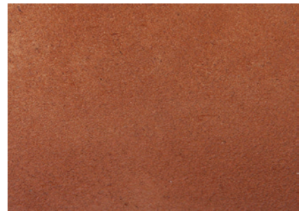
Adobe | 515