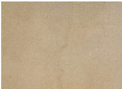
Sahara | 518