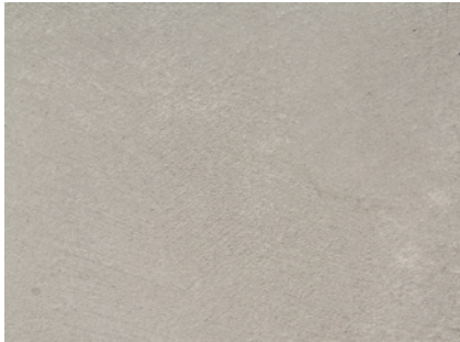
Shale | 516