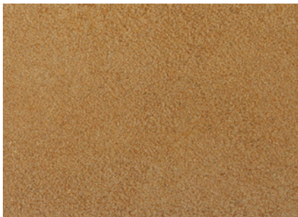
Camel | 505