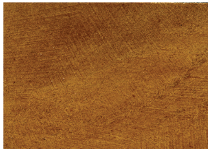
Sepia | 511