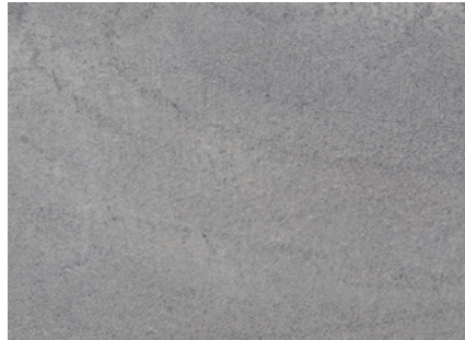
Armor | 514