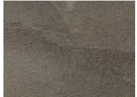
Onyx | 509