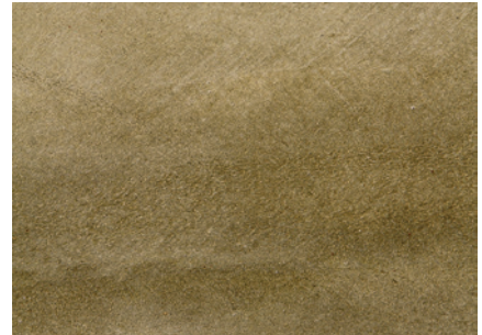
Olive | 520