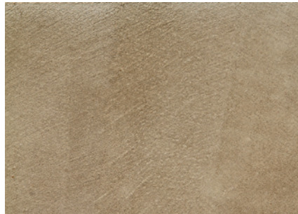
Umber | 521